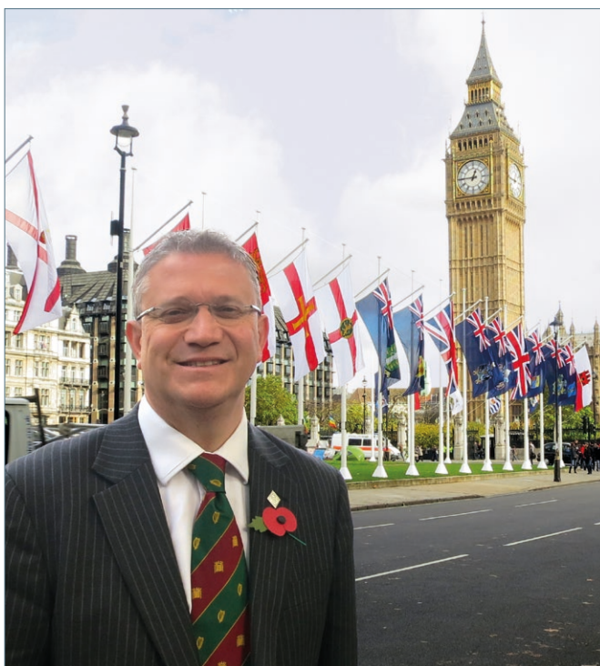
Andrew Rosindell MP in Parliament Square with the flags of the Overseas Territories and Crown Dependencies

I have no doubt that the Flag Institute's work on our flag will become the point of reference in years to come.