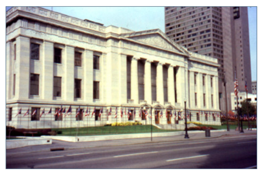
7. State Flags at the State Capitol

As we have seen above, general acceptance of the new flag was not immediate, but gradually as time passed, the flag gained more and more popularity. Today it is not an exaggeration to say that Ohio's flag is one of the most popular state flags in the nation. In some states, as one travels about, one is hard put to find the state flag flying anyplace but a state government building. Such is not the case in Ohio, where the flag proliferates and is widely flown by the citizenry. In Columbus, at the rear of the State Capitol building, there is a prominent display of 88 state flags to honor each of the counties and their war veterans (Fig. 7). Candidates for state office frequently embrace it in their campaigns as a widely recognized symbol, and Ohioans are proud that their state flag is the only one of the fifty state flags that has a swallow-tailed shape (even though some flag manufacturer in Taiwan apparently misinterpreted this fact by incongruously placing the flag's basic design on a white rectangle) (Fig. 8).