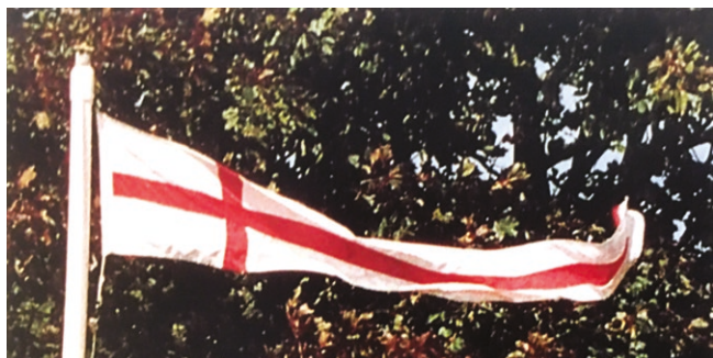
A Pennant (Scandinavian Vimpel)

the pennant (sometimes called a pennon) is not a flag as such (and is never flown at half-mast). The pennant has the advantage that it need not be hauled down at sunset, thus saving much time and effort. It may also be cheaper than a flag.