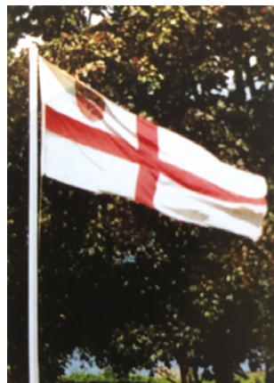
St George's Cross and a Diocesan Flag

* Flag proper is a technical term meaning the flag to be flown from a church when it is wished to represent the organisation of the church itself.