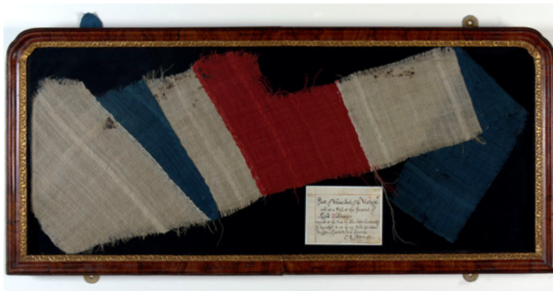
Fragment of a wool bunting, hand-sewn flag, From HMS Victory

Depending on the outcome of the tests it is hoped that flags could be wet cleaned and then the weaves re-aligned. New support fabrics (probably a fine nylon net) would be dyed to blend with the original colours and then stitched to the verso and possibly the face of the flag to provide sufficient support to allow them to be displayed.