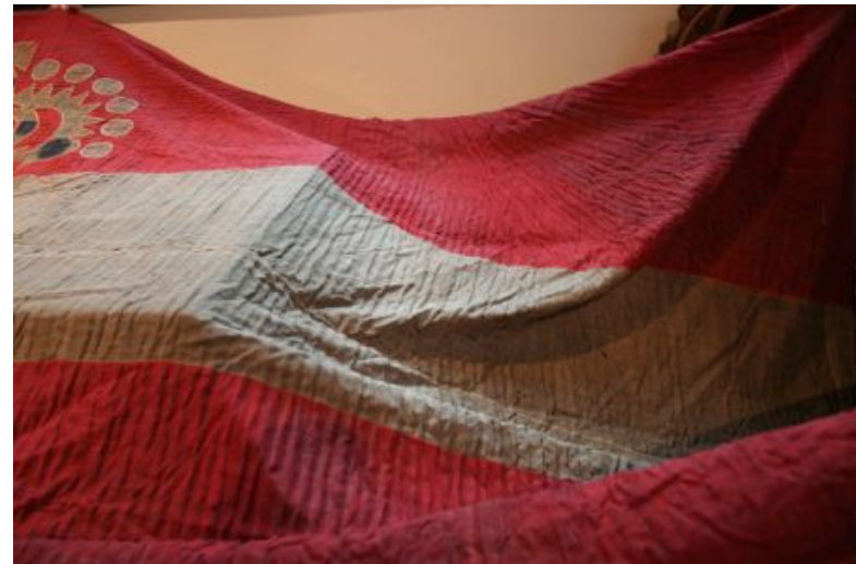
Conservator's photograph of the detail of the Austrian Flag