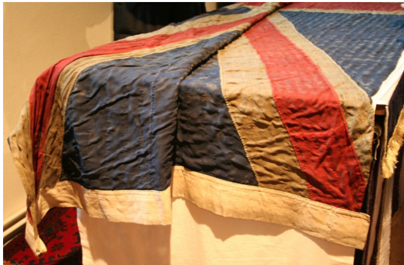
Conservator's photograph of detail of the Union Flag from HMS Minotaur

The National Maritime Museum has now launched a campaign to raise the £175,000 to acquire and conserve these incredible items and we are seeking support to assist with this important purchase. We are delighted to announce that a foundation has generously pledged a grant of £50,000 and with individual donations being received we have just under £120,000 to raise.