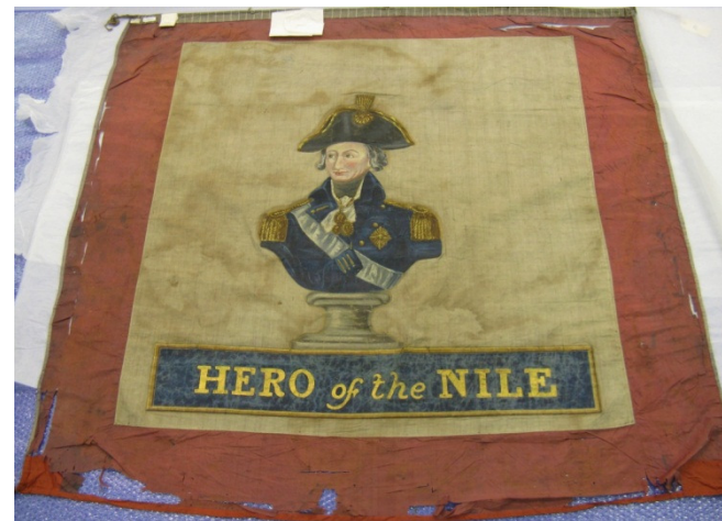
Double-sided linen banner painted with a coloured bust of Vice-Admiral Horatio Nelson