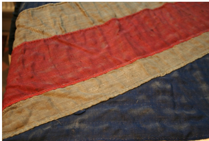
Conservator's photograph of detail of the Union flag from HMS Minotaur

The colour of both flags is good and little fading appears to have occurred over the years.