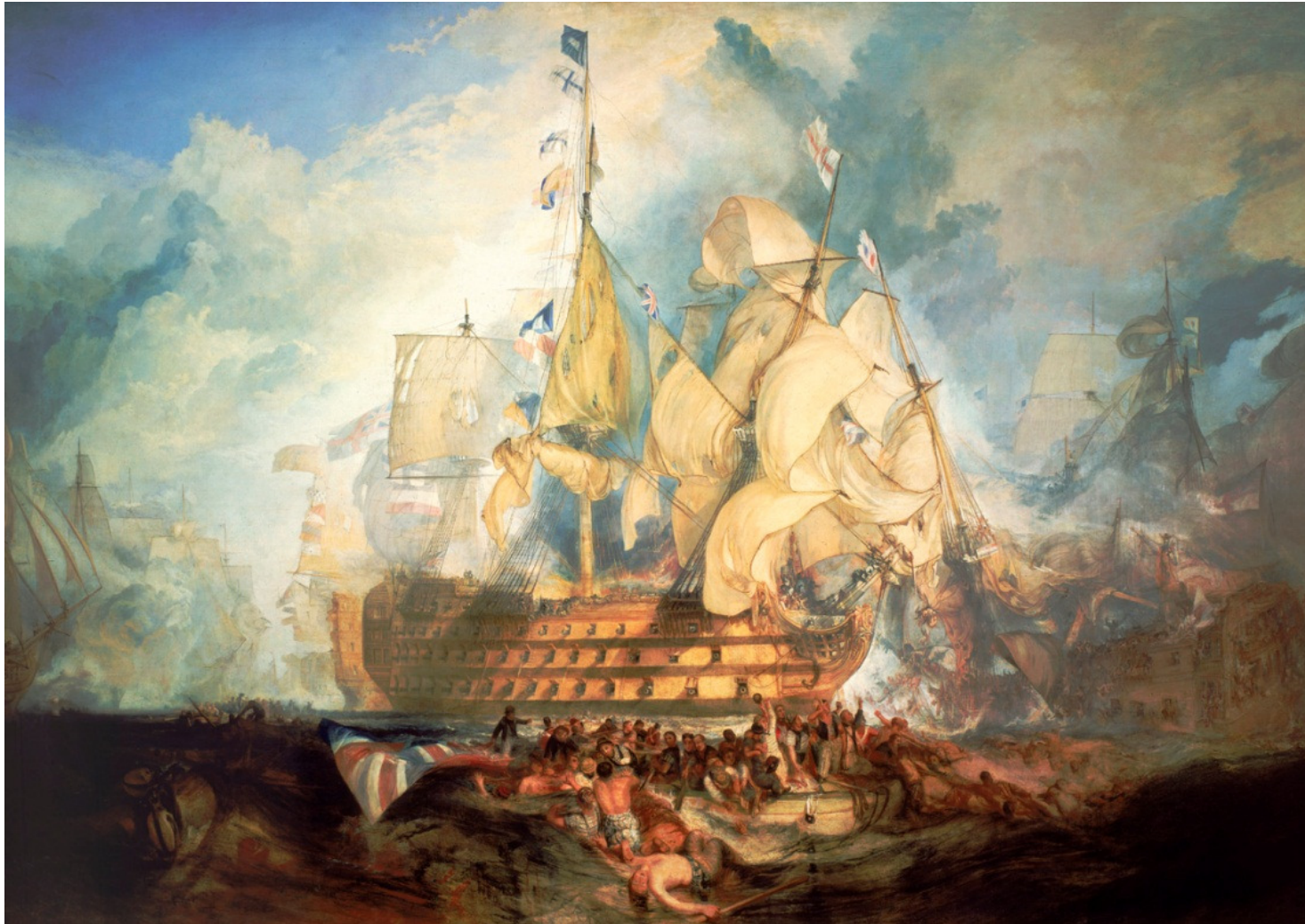
The Battle of Trafalgar, 21 October, 1805 , Joseph Mallord William Turner, 1822-24, BHC0565 National Maritime Museum, Greenwich, London, Greenwich Hospital Collection

HMS Victory (centre) still flying the flags of Nelson's famous signal, 'England Expects That Every Man Will Do His Duty'. To the left of Victory's main mast is the Union flag, which has been loosened by the French ship Redoutable which was dismasted.